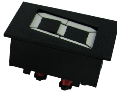
Later Style (Current)