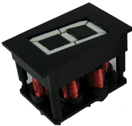
Early Style (Discontinued)